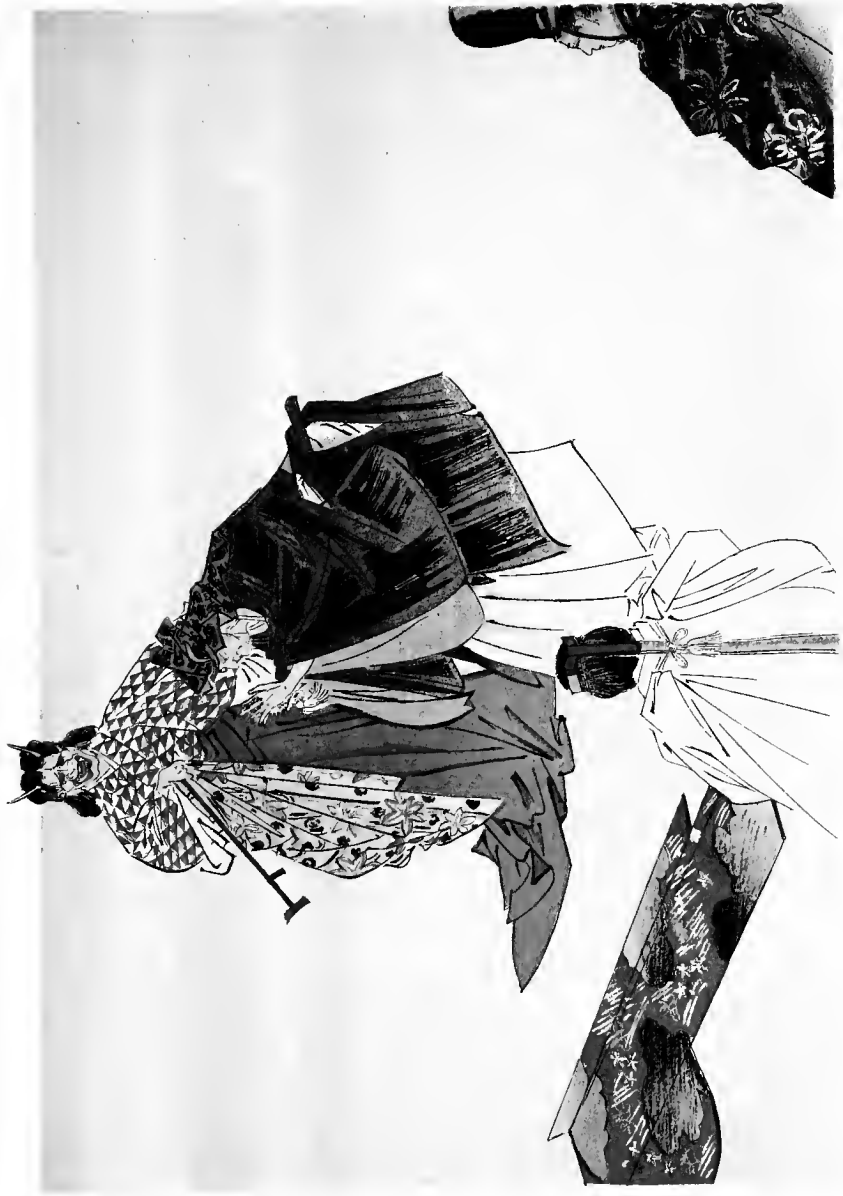
Jealousy exorcised from Aoi-no-Uye (Nō).